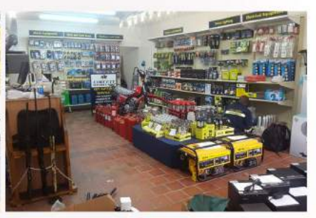
Fawcett Security Shop