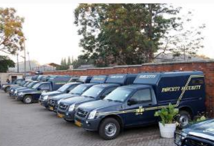
1-Tonne Standard CIT Vehicles