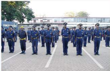
Guards on parade