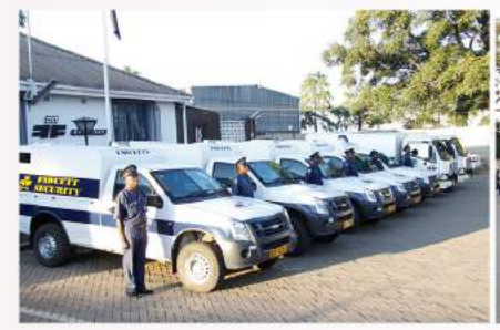
1-Tonne Armoured Division Vehicles